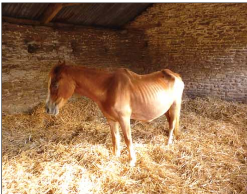
Opal when she arrived at Coxstone

As a result of concern from the Newport Council we took in a very malnourished Section A mare that was clearly in need of extra care. Tests were taken and it was found that she had very low blood and protein levels and a large worm burden. In spite of our careful treatment she unfortunately came into our care too late to be able to save her, but at least we were able to give her a good end to her life. Sadly we also found out that she was 5 months in foal.