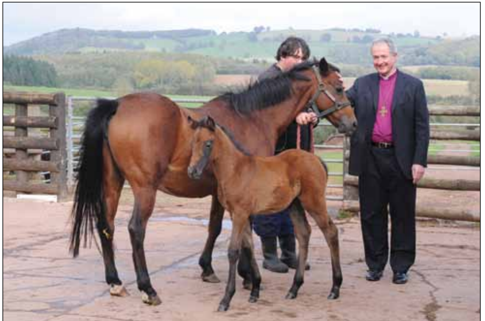
The Bishop of Monmouth pictured here with Isla and Whisper, on a recent visit.

Whisper will now need to be cared for and nurtured up until the day she can be re-homed hopefully as a ridden horse at around five years of age depending on her maturity and character. We may be lucky along the way and find a fantastic temporary home to take her on and handle her before she returns to Coxstone to be backed. The difference between a